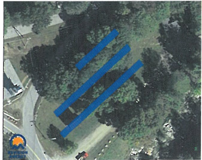
49 Pleasant St, Alstead, NH 03602 (2019 Satellite Data)