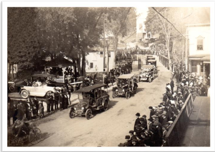
Three Town Fair Parade 1921