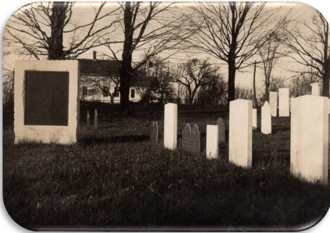
Alstead Center Cemetery