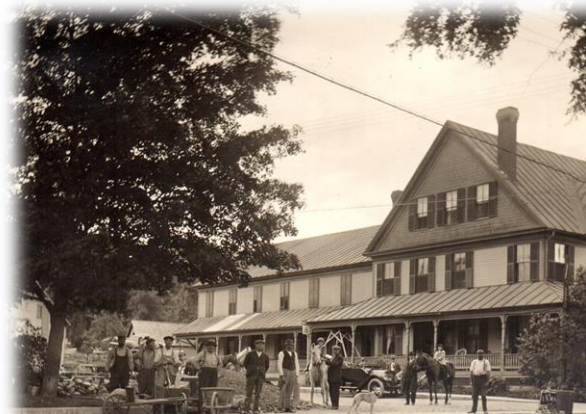
Highway Work Corner of Main and Mechanic Circa 1914

Respectfully submitted, David Crosby Road Agent