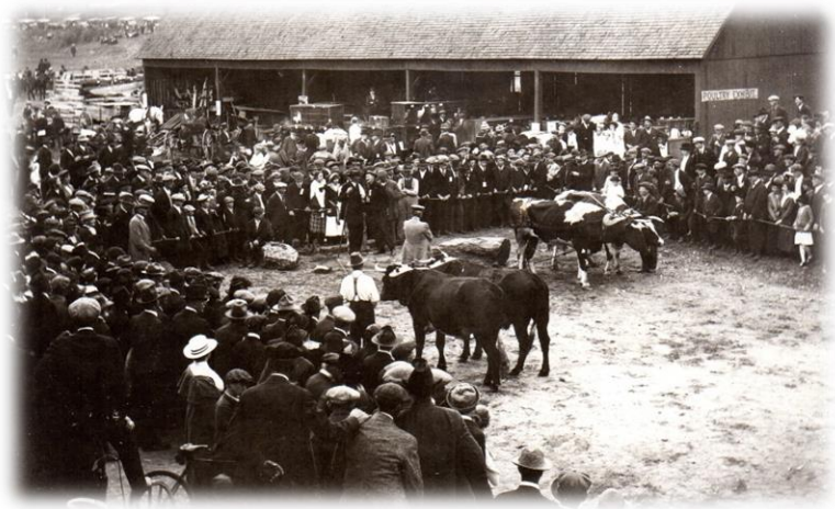
Three Town Fair - 1921