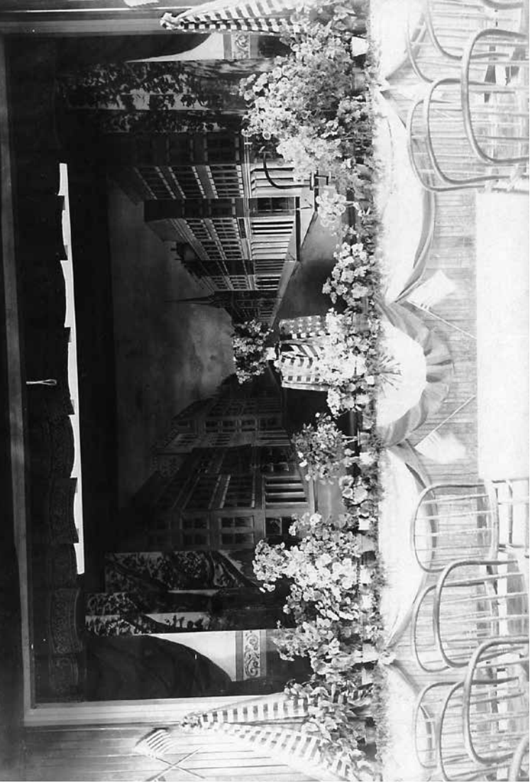
Old Town Hall – Second Floor showing Stage Area – Seated 500 People